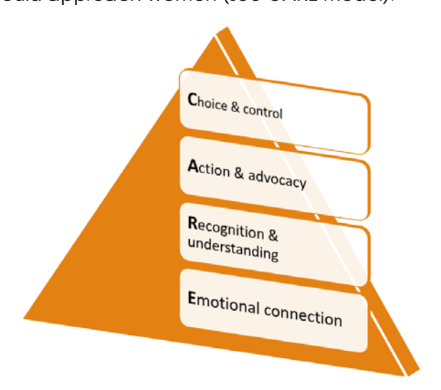
CARE Model for first line response

In addition to LIVES, which addresses 'what' practitioners should do, a systematic review of 31 interview and focus group studies globally with women survivors suggests 'how' practitioners should approach women (see CARE model).<sup>48</sup>